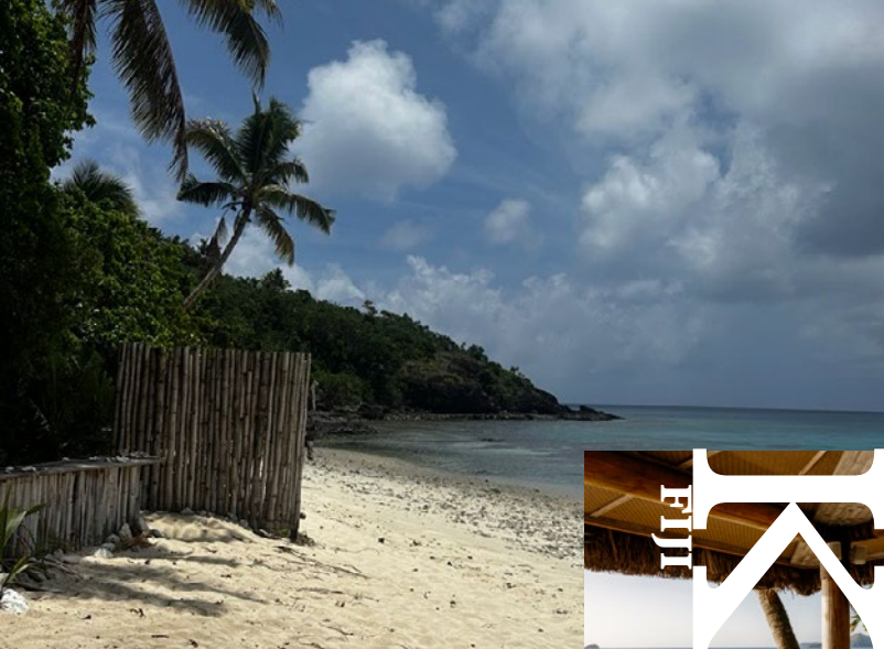
KOKOMO PRIVATE ISLAND PACIFIC ISLE, FIJI