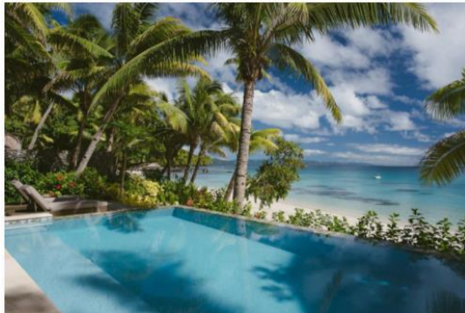
One of the world's most exclusive escapes, Fiji's Kokomo Private Island offers an incomparable ... [+] KOKOMO PRIVATE ISLAND

I travel the world and report back, with a keen eye for the details.