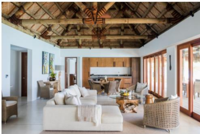
Up to 12 guests can spread out across the resort's luxurious residences and beachfront villas. KOKOMO PRIVATE ISLAND

The lavish, 140-acre retreat, owned by prolific Australian property developer Lang Walker (who spent a reported $100 million building it), has unveiled a buyout package that invites small groups to make the uber-luxe tropical nirvana their own private playground—for a cool $36,000 per night plus tax, with a 12-night minimum stay.