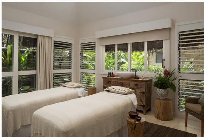
A couples treatment room at Yaukuve Spa Sanctuary.