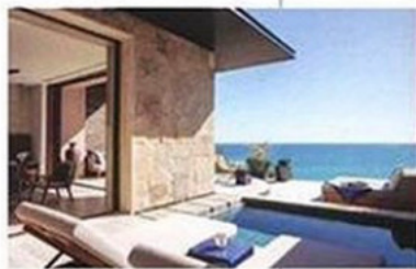
A private patio with plunge pool at Zadún on Baja’s East Cape.

The brand-new Waldorf Astoria Maldives Ithaafushi boasts 122 hyper-luxe villas, a two-villa private island with five pools, and 20 dive sites (including a trio of wreck dives) within a short boat ride. From $1,700, waldorfasteria3.hilton.com