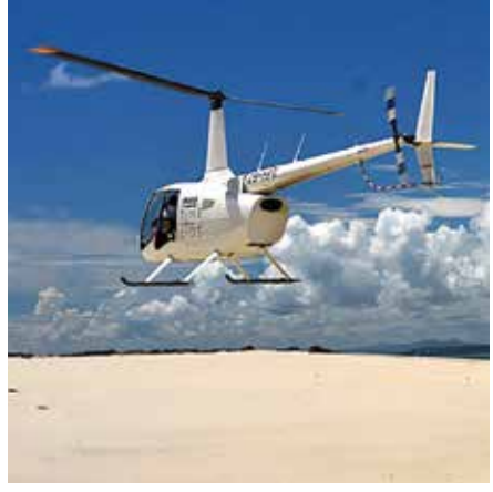
Time + Tide's luxurious Miavana resort in Madagascar can only be accessed by helicopter.