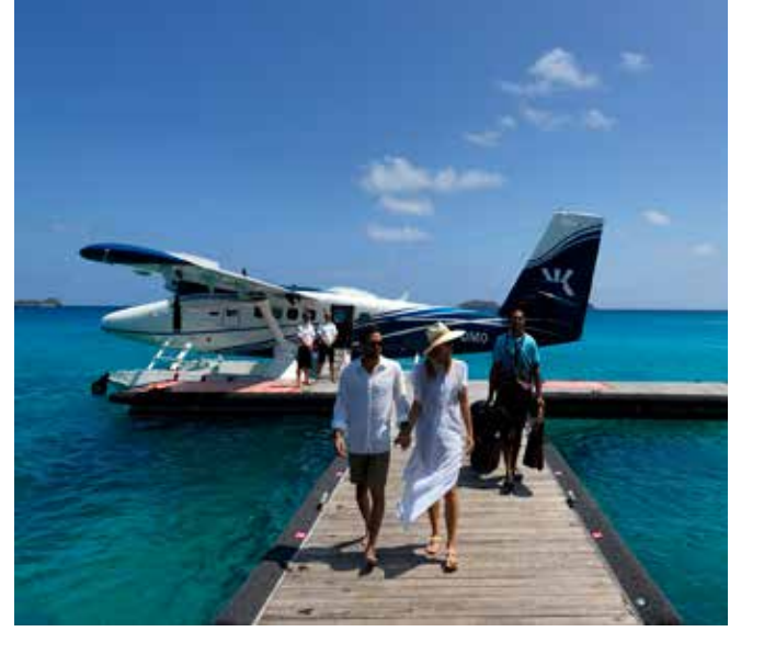
Arriving in style on Kokomo's Twin Otter seaplane.