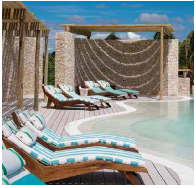
Above left: Kokomo Private Island in Fiji sprawls across 140 acres of lush rainforest and white-sand beaches. Right: Time + Tide is the epitome of a pristine island oasis.

Kayan Jet Saint Kitts provides a gateway to the Caribbean for UHNWI travelers looking for a uniquely crafted door-to-door arrival and departure experience.