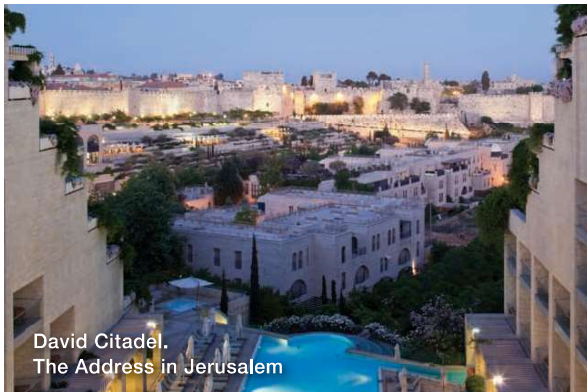
David Citadel. The Address in Jerusalem